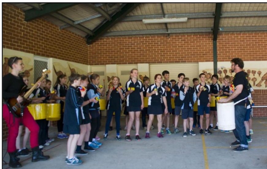
Kalamunda Primary School Percussion practice