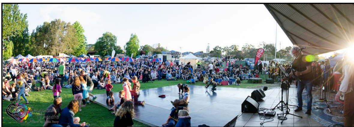
The beginning of the Finale

The 2015 Act Belong Commit Zig Zag Community Arts Festival 'Tracks, Trees and Trains' was a very successful celebration of this important 30th Anniversary of the Festival in Kalamunda. It was made even more special with the inclusion of a celebration of the 10th successful year of operations for Madjitil Moorna choir which was one of the many important community initiatives that Zig Zag Community Arts have fostered in its 30 years of community development projects. The theme brought alive the vibrant history of the Shire of Kalamunda and the Hills area by celebrating the arts, dance and music to wonderfully illustrate the rich cultural heritage that we enjoy.