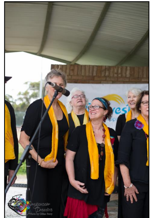
Madjtil Moorna Choir

Early in the afternoon Madjtil Moorna Choir performed many of their favourites and some new songs as well. This is the 10th year this choir has been in operation, having started as a 6 month project with Zig Zag Arts in 2005 before it became it's own incorporated body. They are the most popular and authentic Noongar singing group in WA.