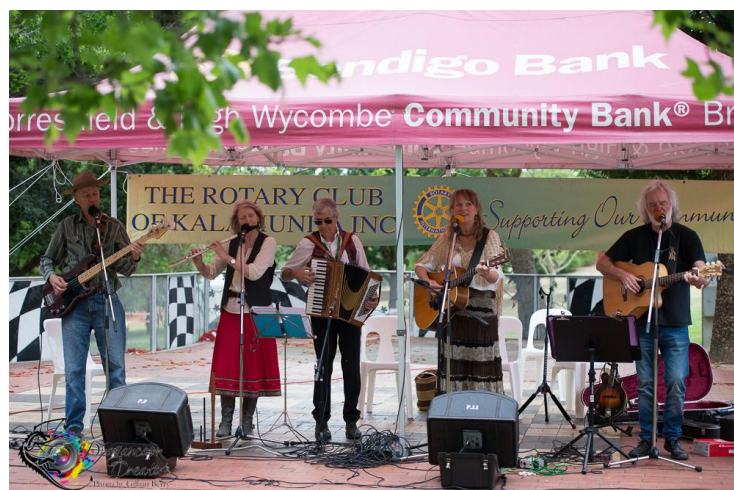
The Pioneers Big Band

performers and the sound desk. Forrestfield and High Wycombe Community Bank another local sponsor, loaned us two double Pop-up marquees which were perfect to set up a much more comfortable, wind, weatherproof and sturdy stage arrangement.