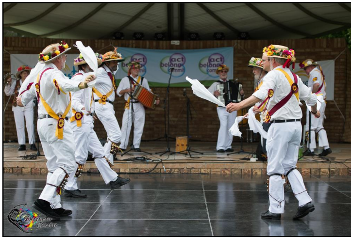
Perth Morris Men entertain the crowd

Early in the afternoon Madjtil Moorna Choir performed many of their favourites and some new songs as well. This is the 10th year this choir has been in operation, having started as a 6 month project with Zig Zag Arts in 2005 before it became it's own incorporated body. They are the most popular and authentic Noongar singing group in WA.