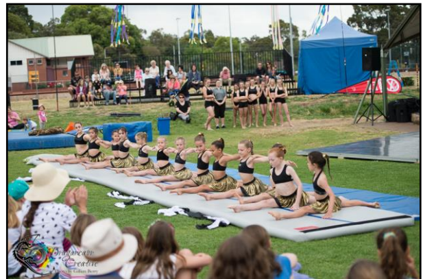
Zig Zag Gymnastics in Action!