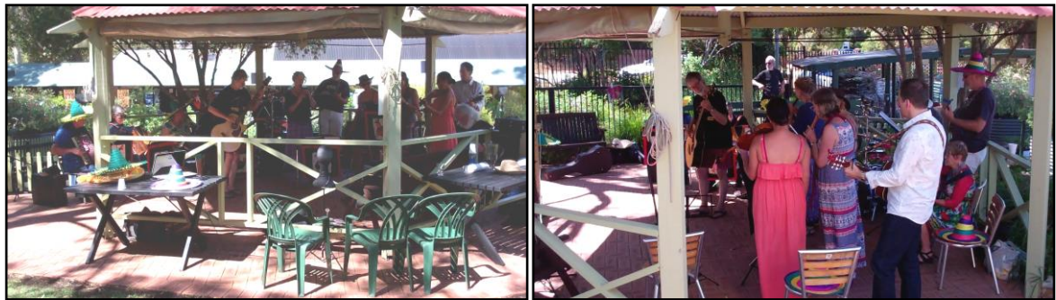
Video Stills Mike Cheffins

8 March at Zanthorrea Nursery in support of ' Garden Releaf ' a fundraiser for Beyond Blue